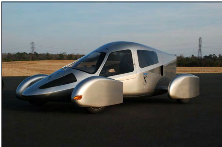
Wainfan-designed car that got over 129 mpg!

The X Prize combined a simple goal with demanding requirements. The goal: a car with mileage greater than 100 mpg. The requirements: 4 passengers, 4 wheels, range exceeding 200 miles, 0-60 in less than 15 seconds, meeting Consumers Union dynamic safety standards and Tier 2 Bin 8 emissions.