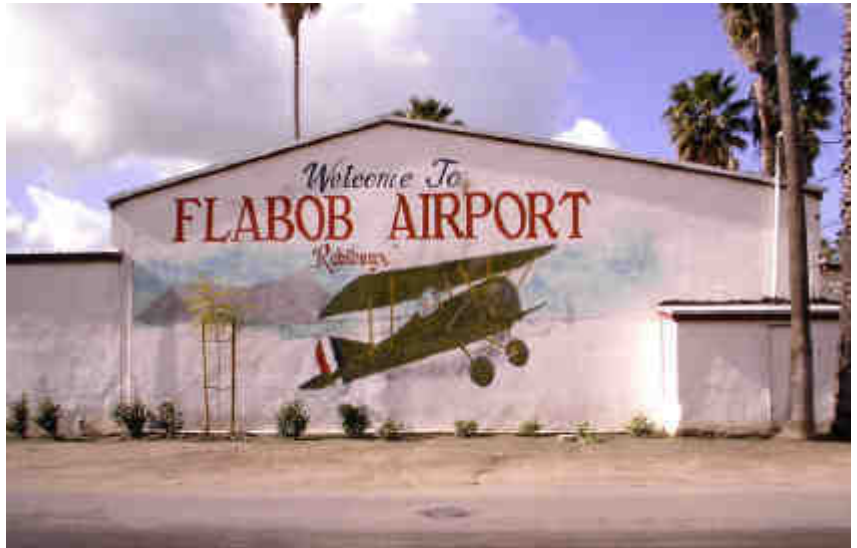
Future home of the Flabob Library

Design work has already begun for new facilities for the aeronautical department of San Bernardino Valley College, which is targeted to move to Flabob in the fall of 2007. The new educational center will also provide permanent space for the Wathen Aviation High School, a public charter high school which began operations using Chapter 1 facilities during 2005. The building will have an aircraft mechanics teaching laboratory as well as classroom space for about 600 students. Plans call for the educational facility to be completed in late fall of 2007.